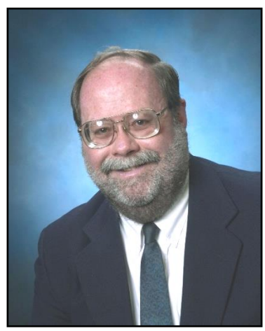
FIGURE 1 PROFESSOR JOSEPH TAINTER

deeply into the mechanisms underlying these civilization collapses, proposing a multidisciplinary analysis. He focuses particularly on the increasing costs associated with societal complexity and how these costs can reach a critical point, beyond which the marginal benefits of complexity no longer justify the investments required to maintain it. Although Tainter (1988) does not explicitly address the logistical dimension in his analysis, his work provides valuable insights into the crucial role that supply chain organization plays in the stability of complex societies. Indeed, these societies rely heavily on sophisticated logistical networks, encompassing both physical infrastructures and information systems. Even today, complex human societies remain vulnerable to logistical failures, making effective resource management essential to mitigate the risk of collapse (Good and Reuveny, 2009). The capacity to adapt logistics to changing circumstances—such as resource shortages, trade disruptions, and environmental shifts—is therefore critical in sustaining the resilience of modern societies amidst increasing global interdependencies.