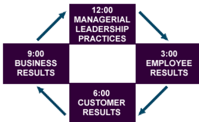
FIGURE 1 LINKAGE RESEARCH MODEL (LRM): ASSESSING PERFORMANCE WELL-BEING AND WELL-DOING PRACTICES

As we assess and measure using the LRM, at the 12:00 o'clock position of the LRM we would include the leadership practices associated with performance, well-being and well-doing. At 3:00, 6:00 and 9:00, respectively, are key results and desired outcomes for employee, customer and organizational/business. The main objective of the linkage research approach is to identify managerial leadership practices operating in the environment (the current circumstance being leader performance, well-being, and well-doing practices at 12:00 o'clock) that influence employee performance, well-being and well-doing as well as customer relations and organizational/business results. To achieve this, managerial leadership practices are assessed and correlated with employee and customer survey data and with other key organizational metrics such as overall organizational performance, well-being, and well-doing. (When applied in the current context the LRM is used to assess individual and group-team performance, well-being and well-doing across organizational levels.)