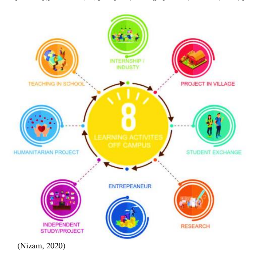
FIGURE 2 EIGHT OFF-CAMPUS LEARNING ACTIVITIES OF "INDEPENDENCE CAMPUS"

Students are allowed to take courses off campus, and students need to be equipped with competencies related to digital learning abilities (Sihombing et al., 2021). As a result, we must conduct this research to develop a suitable physics learning web-based digital learning to increase physics education students' critical thinking skills to maximize the university's MBKM program, which is packaged as the dHOTLearn model based on PLW.