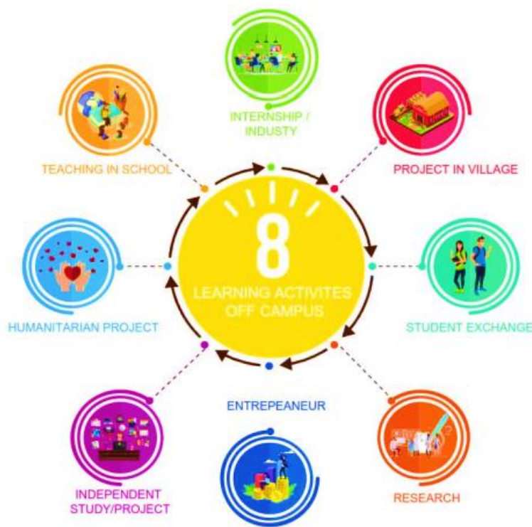
FIGURE 2 EIGHT OFF-CAMPUS LEARNING ACTIVITIES OF “INDEPENDENCE CAMPUS”

Merdeka Belajar Kampus Merdeka (i.e., MBKM) has become a phenomenon and characterizes the product of the Ministry of Education, Culture, Research, and Technology of Indonesia, Nadiem Makarim (Prahani et al., 2020). The idea of eight off-campus learning activities at “Independence Campus” is presented in Figure 2.