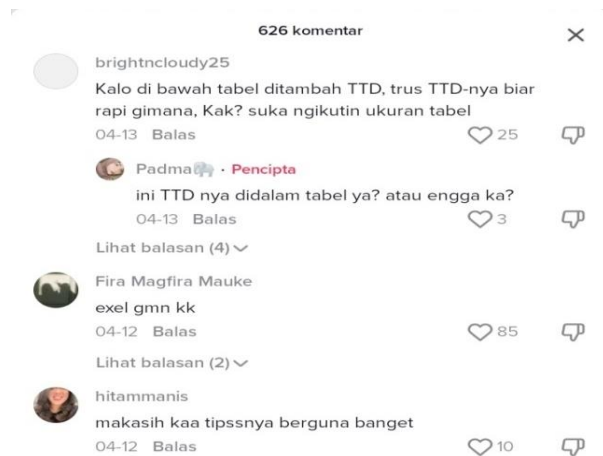
Figure 3 displays a variety of pleasant comments and answers from visitors to learning material on TikTok. Although there are several types of comments, most responses are favorable. The offered comments section also debates the learning material and topics that the viewers do not understand.

The efficacy of TikTok is in line with the comment made by the first resource person,