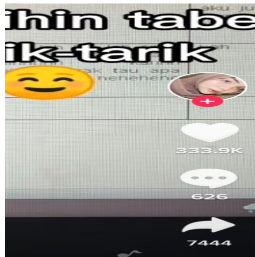
FIGURE 2 TRAFFIC OF THE CONTENT

Figure 2 depicts one of the learning video materials. The amount of likes is 333,900, and there have been 626 comments. Additionally, the material has been shared 7,444 times. It is due to the educational learning material entering the For Your Page (FYP) and receiving many replies from viewers, resulting in a rise in traffic due to the video content's popularity.