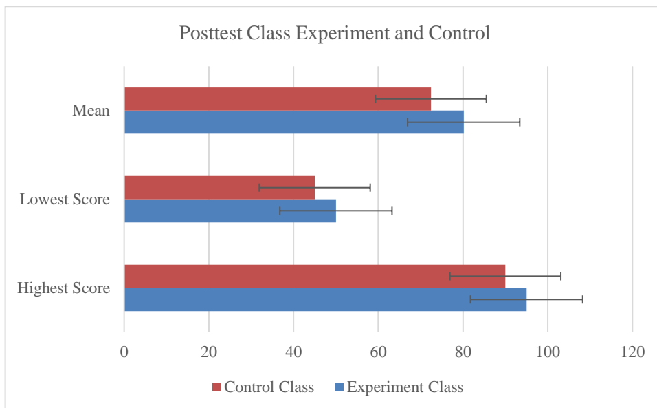
FIGURE 2 BAR CHART COMPARISON OF POSTTEST RESULTS DATA FROM EXPERIMENTAL CLASS AND CONTROL CLASS

There are disparities in the acquisition of learning outcomes between the two classes, according to the pretest and posttest data analysis on the learning outcomes of the experimental and control classes. The experimental class pretest had an average value of 54.19, while the control class pretest had an average value of 52.27. While the control class's average posttest score was 72.42 and the experimental class's average posttest score was 80.16. Table 4 below shows a comparison of the experimental and control classes' pretest and posttest scores.