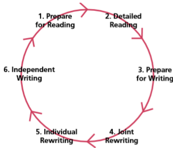
FIGURE 1 R2L CYCLE

Scaffolding plays an essential role in GBP, especially during the stages of detailed reading, and preparation for the writing process. The scaffolding interaction cycle will be illustrated in figure 2. According to Martin and Rose (2005) the scaffolding cycle allows all learners to answer correctly 100% of times, regardless of their starting points. The three scaffolding stages within the cycle are: prepare, identify, and elaborate.