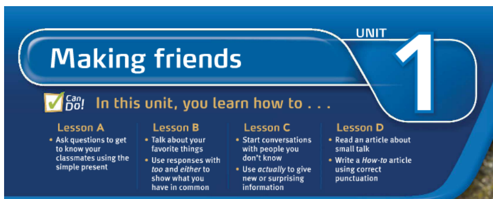
FIGURE 4 BOOK SKILLS ORGANIZATION

This phenomenon may be due to several reasons. One may be the institutional requirement of developing the language skills across the curriculum, which might have been interpreted by teachers as the need to develop communication skills, for which students need to develop grammatical and vocabulary knowledge, as supported by Tomlinson et al, (2001) who manifests that “reading sections often start with vocabulary activities related to the texts and many reading units feature short texts used mainly for teaching grammar”. Another reason could be the reliance on a coursebook for the development of the classes in these courses, and the distribution of the units in the coursebooks. Each unit starts with the identification of the vocabulary and grammatical patterns that will be developed, as illustrated in figure 4.