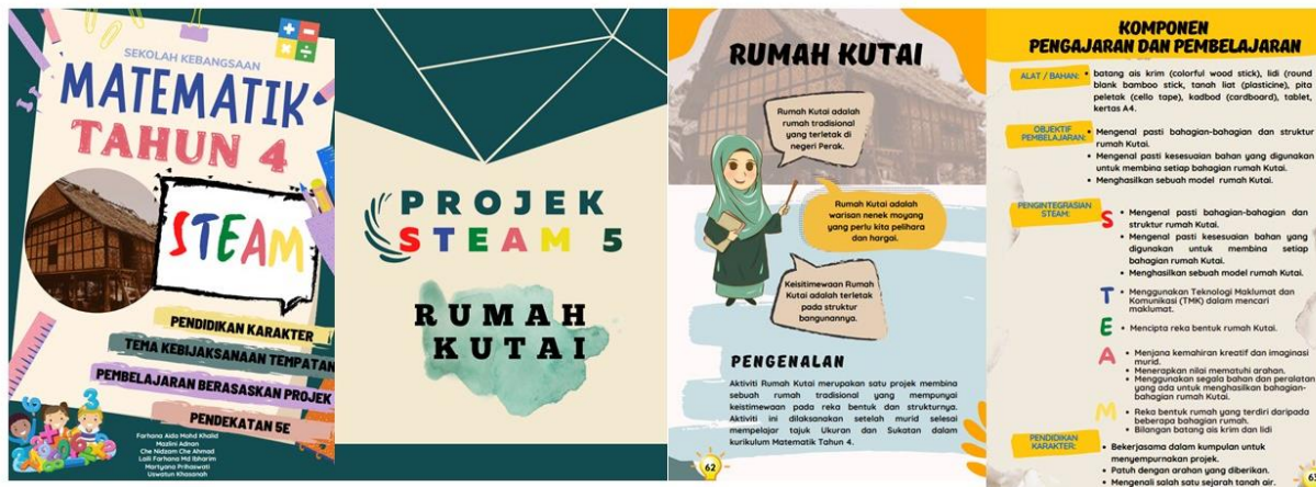
FIGURE 3 STEAM TEXTBOOK DESIGN