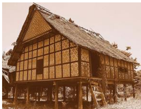
FIGURE 1 KUTAI HOUSE

Kutai house (Figure 1) in Pasir Salak is a historical element to be used in this study. One of the uniqueness of the Kutai house is built without nails. With the uniqueness of this Kutai house (the design and structure), it is _ to be the main focus of the STEAM textbook. Therefore, even though students are studying in the STEAM field, the local history element remains intact. Therefore, to ensure that the increasing ratio of students interested in science and technical education and at the same time local wisdom need to be known, this study needs to be carried out. To achieve the goal of becoming a developed nation capable of meeting technological challenges and economic demands by 2050, each of these students needs to be shaped according to future needs.