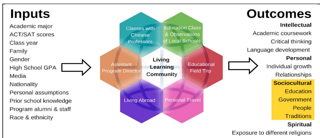
FIGURE 2 INPUT-ENVIRONMENT-OUTCOME MODEL BASED ON ASTIN (1984)

affected their views before entering the new environment like media, personal assumptions, and program alumni and staff. The environmental factors are the elements of the LLC that students self-reported as playing a significant role in shaping their sociocultural perceptions of China (Figure 2). Lastly, the outcomes revealed how students' sociocultural understandings of China were confirmed or transformed from their living-learning experiences.