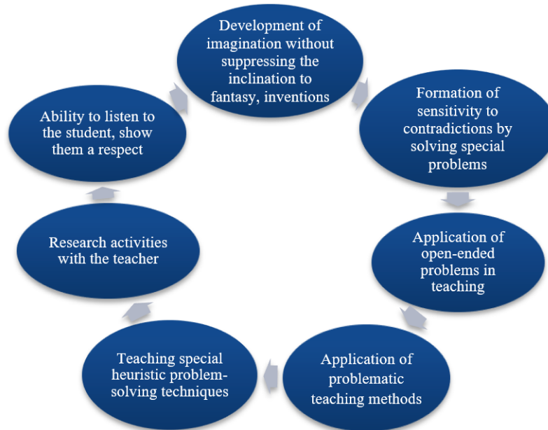
FIGURE 2 STAGES OF CREATIVE THINKING DEVELOPMENT

The authors found that insufficient professional orientation and low level of academic motivation hold a second position among the student dropout reasons, after the lack of desire to study and work in the chosen