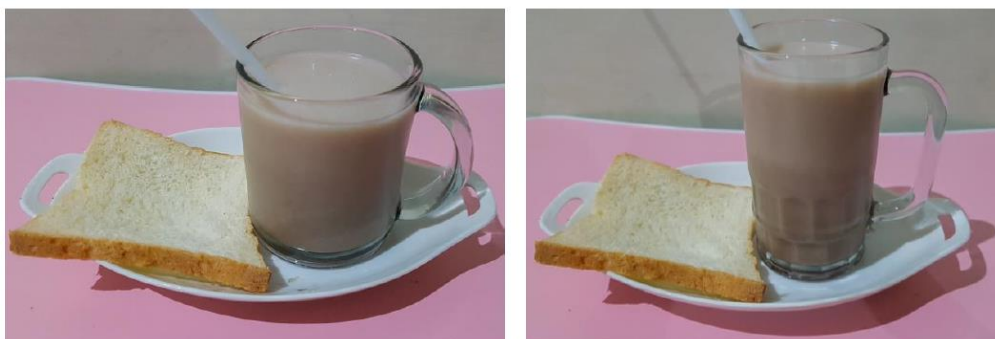
FIGURE 1 THE PISA-LIKE PROBLEM WITH LOCAL CONTEXT OF SURAKARTA

Research instruments consist of PISA-like tests of local Surakarta context, observation sheets, and interview guidelines. The instruments have been through the assessment and evaluation stage called content validity. It has been established by determining the domain of the instrument content through a review by a subject matter expert by alignment studies (Sireci & Faulkner-Bond, 2014; Thompson & Senk, 2017). The content validity stage conducted by employing three validators. They are experts in PISA problem development, mathematical literacy skills experts, and qualitative research experts in mathematics education research. Validators make improvements to redactional, and substances adapted to PISA standards. The value of local context can help students understand mathematical phenomena from the perspective of their own life experiences so mathematics much more exciting and beneficial for all students (Charmila et al., 2016; Murtiyasa et al., 2018). Because the research employs students from Surakarta, the local context used on the test is the local context of Surakarta. PISA-like problem with local context of Surakarta is presented in Figure 1.