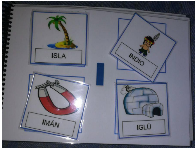
FIGURE 5 PICTOGRAMS TO ENCOURAGE PRE-READING