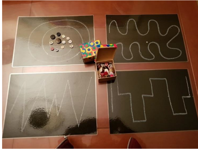
FIGURE 3 MATERIALS FOR PINCER GRASP (FINE MOTOR SKILLS): PRE-WRITING