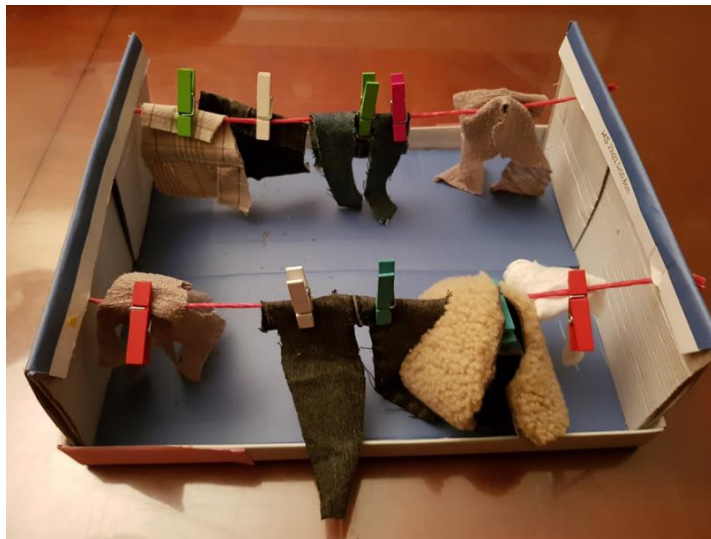
FIGURE 1 MATERIAL FOR PINCER GRASP (FINE MOTOR SKILLS): PRE-WRITING