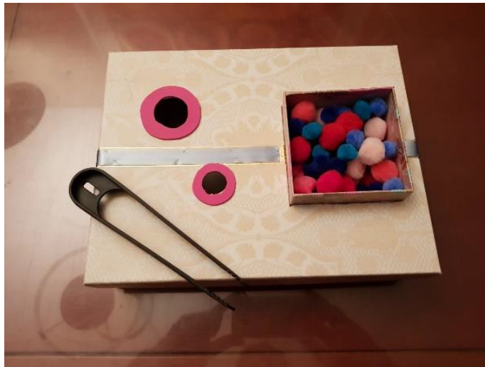
FIGURE 4 MATERIALS TO TRAIN THE PINCER GRASP (FINE MOTOR SKILLS)