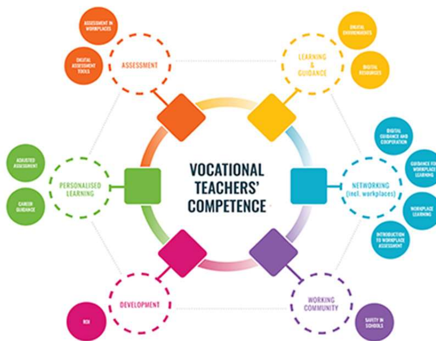
FIGURE 3 THE BADGE CONSTELLATION OF VOCATIONAL TEACHERS

Figure 3 presents the Badge Constellation of Vocational Teachers’ Competence. The constellation is a living document, and there will be new competences as well as replaced competences over time. The constellation consists of six competence areas: Learning and Guidance, Networking, Working Community, Development, Personalized Learning, and Assessment.