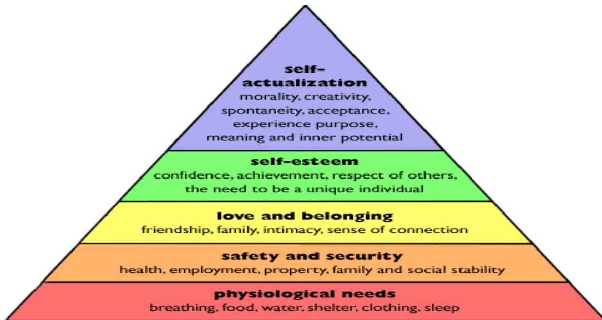
FIGURE 2 MASLOW'S HIERARCHY OF NEEDS

Adopted from Maslow's Hierarchy of Needs, (1943); Maslow & Lewis, (1987), & Poston, (2009)