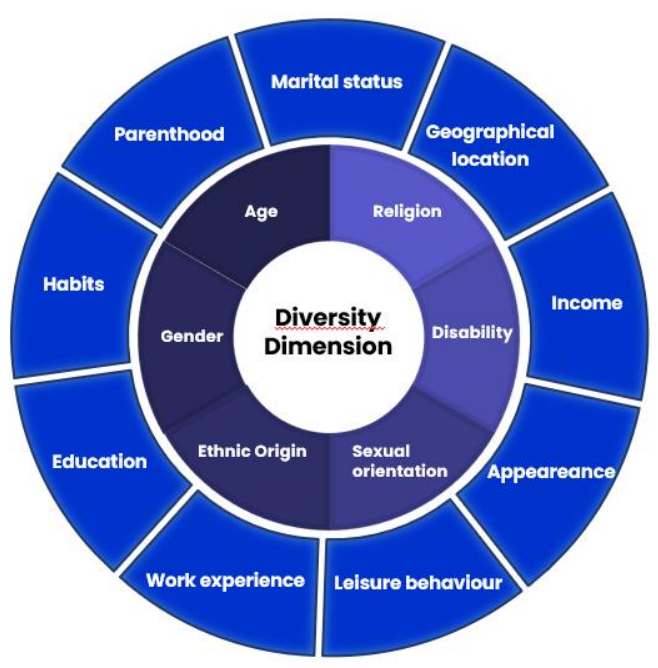
FIGURE 1 DIVERSITY DIMENSIONS

Diversity is a multi-dimensional construct composed of inner (core) dimensions, which include the well-known basic diversity dimensions, e.g. age, gender, or ethnicity, as well as external dimensions, which describe the diversity in relation to one's own environment, e.g. education, parenthood or income. All equity dimensions are equally important and can interact with each other (figure modified from ref. (Atruvia AG, 2021)).