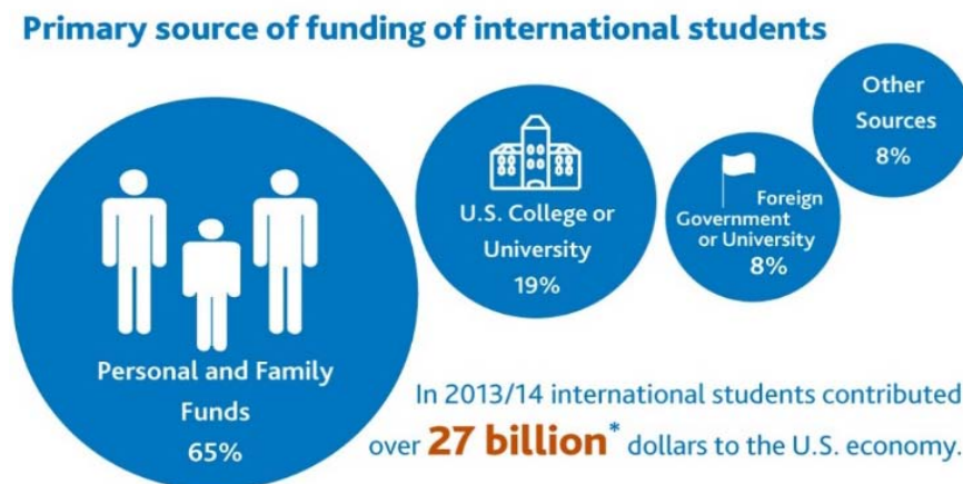
FIGURE 1 INSTITUTE OF INTERNATIONAL EDUCATION (2014). OPEN DOORS REPORT ON INTERNATIONAL EDUCATIONAL EXCHANGE

As public universities limit the admission of in-state residents due to the higher tuition costs paid by out-of-state and international students, they are increasingly on par with private schools in their quest to resolve budgetary woes. For example, the number of nonresident students enrolled within the University of California system increased nearly 33 percent from 22,984 to 31,991 between 2009 and 2012 — indicative of a nationwide trend (Pratt, 2014). According to the College Board’s “Trends in Education,” resident students paid an average of $8,893 for tuition and related fees at public, four-year institutions in 2013-2014, while out-of-state students paid approximately $22,203. Approximately 74% of these students cover their tuition and other related collegiate costs through outside sources, including private loans, family contributions, and/or foreign government-sponsored initiatives (IIE, 2014).