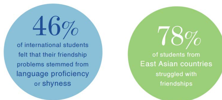
FIGURE 2 INTERCULTURAL FRIENDSHIPS: EFFECTS OF HOME AND HOST REGION (GAREIS, 2012)

Language barriers also greatly stymie integration (Hegarty, 2014). While many universities require students to score well on standardized English proficiency tests, high scores on these tests are no guarantee that the student is proficient in spoken English. The University of Chicago, for example, requires that the international undergraduate applicant must demonstrate “a superior level of English language competence” for admission eligibility and requires minimum scores on either the Test of English as a Foreign Language (TOEFL), the International English Language Testing System (IELTS), or the Pearson Test of English (PTE) ( https://collegeadmissions.uchicago.edu/apply/applicants/international/#english-proficiency ). Even when the nonresident student communicates well orally, thick accents or different pronunciations of commonly-used words evoke quizzical or often frustrated looks from domestic students, and in some extreme cases, even ridicule. In class, when the international student asks a question or participates in class discussions, there is potential mutual public embarrassment as both domestic faculty and students, and the international student, struggle to communicate in a public forum amidst ever-watchful and critiquing eyes (Hechanova-Alampay et al., 2002).