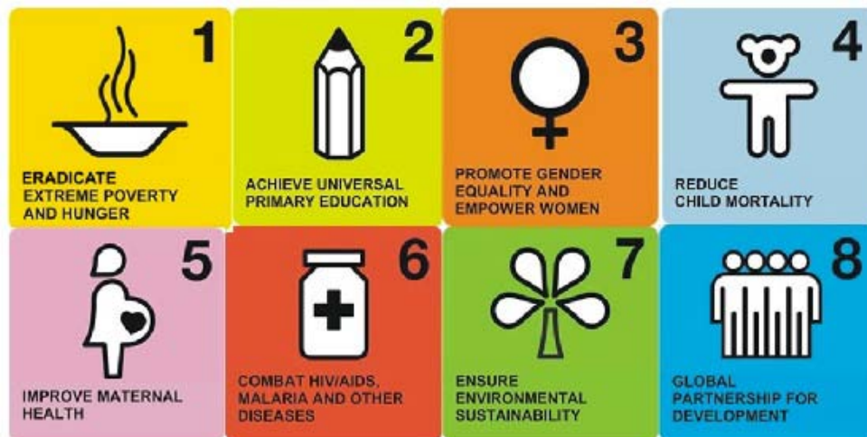
FIGURE 2 MILLENNIUM DEVELOPMENT GOALS (UN-MDGs, 2015)

The Millennium Development Goals in Figure 2 (UN-MDGs, 2015) encompass a spectrum of eight long-term development goals through an incredible global push in development aid coordinated by the United Nations. The MDGs involve agencies from all parts of the globe and interface with academia on a multitude of projects. Similar to the UN cluster system, we believe that field work geared towards the MDGs can benefit from additional OR/MS expertise. There are many organizations with varying size levels making positive impact and progress towards these goals and it is within our capacity to learn from and contribute to their work.