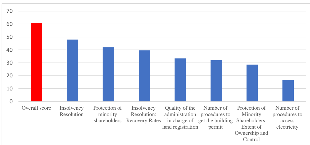
FIGURE 2 AREAS OF DOING BUSINESS WITH LOW SCORES IN COTE D'IVOIRE IN 2019