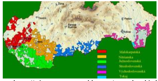
FIGURE 2 WINERIES IN SLOVAKIA