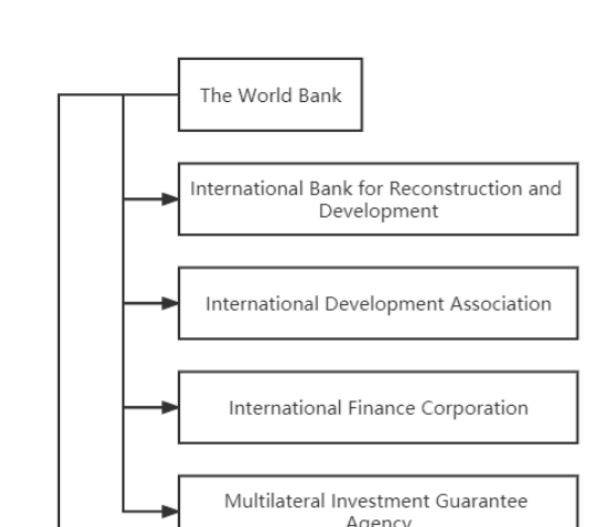
FIGURE 2 STRUCTURE OF THE WORLD BANK'S BRANCHES

the anthropologist's effort was to show that the requirement of anthropological and sociological social research and analysis and its embedment in development projects are not a luxury or an irrelevant add-on in development projects when they are being introduced. It is as necessary an initiative as an economic analysis in designing an adequate goal orientation, together with a confirmation of the feasibility of development projects. The World Bank's interface with anthropology is not a one-way and passive process, but a two-way interaction. The World Bank recognizes the importance of anthropology and hires anthropologists to work for it. At the same time, anthropology strives to prove its practical value and tried to change the World Bank's decision-making rules.