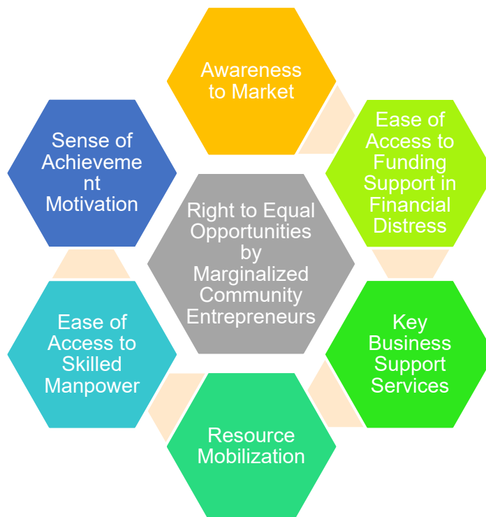
FIGURE 2 ECOSYSTEM FOR RIGHT TO EQUAL OPPORTUNITIES

The epidemic has pressed the fast-forward button, hastening the adoption of new technology. In this precarious time, it has also exposed the digital vulnerabilities of marginalized communities and networks, such as craftspeople. Online training programmes for artisans and micro-entrepreneurs are needed to help them sell their items using digital resources. Apart from inputs in the areas of modernizing designs, market access, and financing linkages, today's micro-entrepreneurs must be familiar with displaying their products on both physical and virtual platforms.